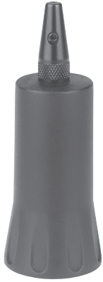
Low band coil for 40 - 50 MHz.