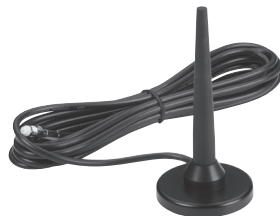
MMC/P3EFME Magnetic Mount