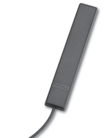
R380.900.323 Adhesive Mount