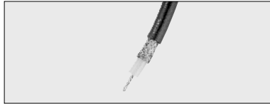
RG-213 - Stranded Bare Braid - Mil Spec QPI

Stocking Lengths: 1000'/Spool Cut to order