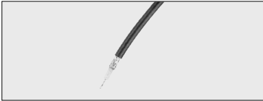
RG-58A/U - CX Standard Coax

The industry standard in quality, value-priced coax. Stranded center conductor offers good flexibility and long-life under most conditions. Not typically recommended for applications above 512 MHz due to higher losses. Uses standard RG-58 connectors.