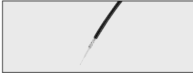
RG-174 - Small Diameter Coax

In this section, you will find a wide variety of cables and connectors to suit your needs, no matter what your specific application might be. Please be sure to consider such parameters as acceptable loss, temperature, noise and connector type when making your selection.