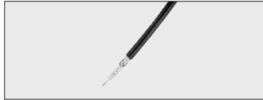
RG-58A/U - "Digi-Shield"™ Low Loss Braided Center

Stocking Lengths: 1000'/Spool Cut to order