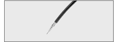
RG-58U - Low Loss Dual Shield with Solid Center Conductor (UD)

Stocking Lengths: 500', 1000'/Spool Cut to order Belden 8267